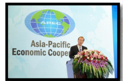
Neil Bush addresses the APEC conference